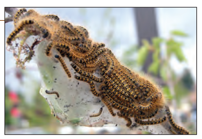
Above: Tent and larvae of the western tent caterpillar