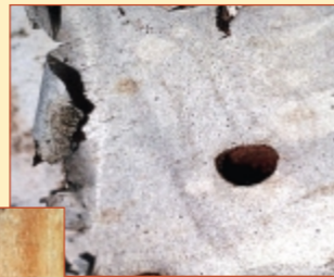
(Top Left) Bronze Birch Borer Adult (Top) Hole made from Bronze Birch Borer (Left) Destructive Larvae of Bronze Birch Borer