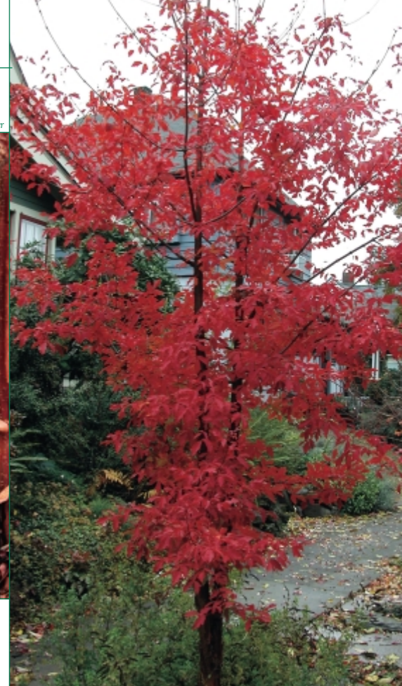
(Above Left) The bright cinnamon exfoliated bark adds to the tree's four-season appeal. (Right) The paper bark maple has reddish cedar-like bark, and feathery soft textured foliage.