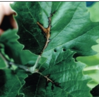
(Far Left) Dogwood leaves infected with anthracnose (Left) Sycamore with anthracnose

Thinning and deadwood removal pruning can help to reduce the conditions within the trees canopy favorable to disease establishment. By opening up the trees canopy, light penetration into and air movement through the trees canopy can help to reduce disease damage. We can treat anthracnose on a preventative basis, contact our office to schedule an inspection of your landscape