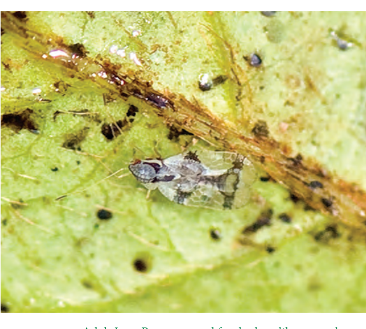
Adult Lace Bug: so named for the lace-like network of veins on their translucent wings