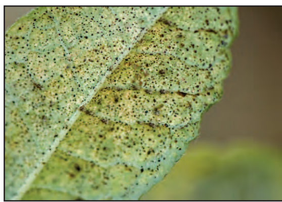
(Above) Leaf stippling caused by lace bugs sucking out the chlorophyll

(Below) Tar spots (excrement) from the lace bugs