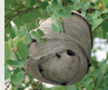
Hornet nests are well hidden in trees, shrubs or in the ground. Check plants and outdoor areas carefully to prevent attacks and stings.

That Texas Chainsaw massacre could happen in your backyard this weekend. Many weekend warriors in the garden may not think to protect themselves from the dangers of yard work. When in doubt hire a professional arborist who has the safety training, the skills and the excellent safety record to tackle your backyard project. Collier employees have gone 1423 days without a time loss accident — an admirable achievement for our safety-minded 16 certified arborists performing tree, shrub and lawn services in your landscape.