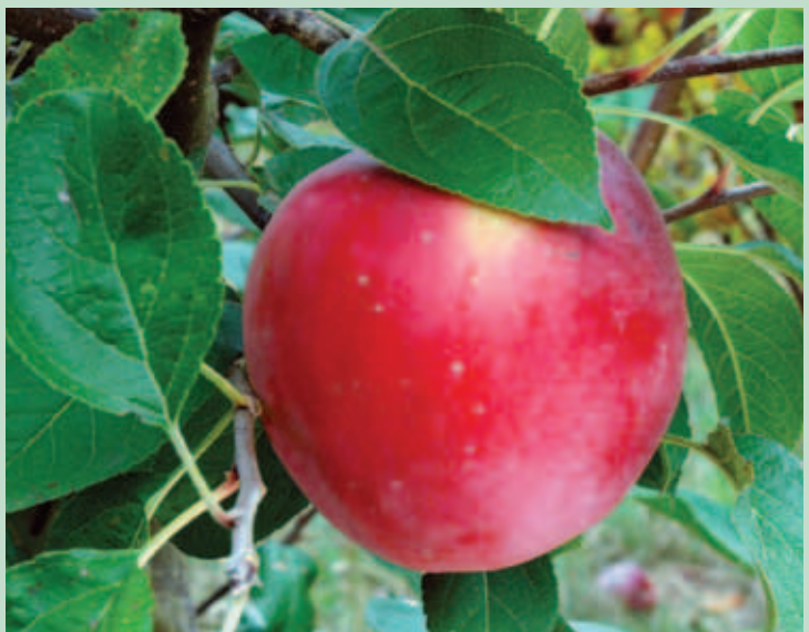
Grow your own mouth-watering apples with a disease-resistant 'Liberty'.