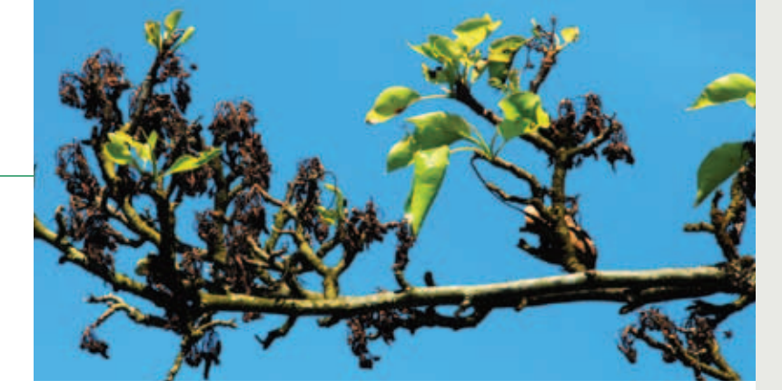
Scab disease on a flowering pear. Plant diseases infect during wet Spring weather, but preventative treatments need to be applied before and after

A 'Liberty' apple is a new, improved, disease resistant variety. I have grown this variety and can attest to its resistance to scab and mildew and to the full crispy flavor of this tasty fruit. If you have a small yard or want to easily pick fruit from the ground, grow this