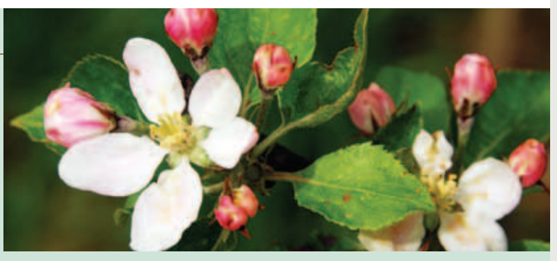
Bright blossoms and tasty fruit are yours for the having when you plant a disease-resistant Liberty Apple Tree.

For more information on specific diseases, visit our web site at collierarbor.com. You'll find Fact Sheets on Anthracnose, Verticillium and other destructive diseases.